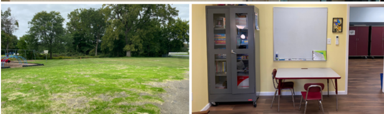
The trailer at PES (top) has been removed. Pictured (bottom right) is a new office space located inside the elementary school.

The trailer at Poestenkill Elementary School has been around for many years. Over that time it served a number of different purposes, from guidance services to storage. Although it was once useful, in recent years it deteriorated and became an eye sore. In September, it was removed.