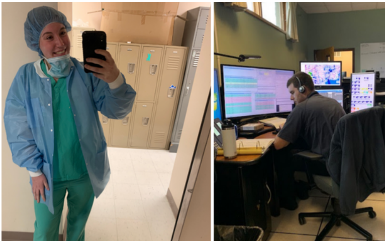
APHS students at their job shadowing placements.