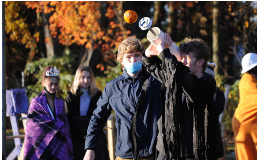
High school students launch pumpkins as part of a Physics project.

In this newsletter, we are showcasing some of the great things that have happened throughout the District, at each level, so far this year.