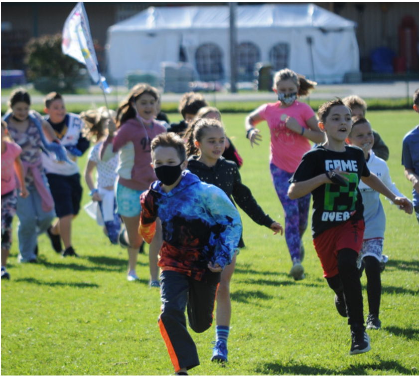
Students at Miller Hill-Sand Lake Elementary School participated in the annual Fun Run Boosterthon Fundraiser.