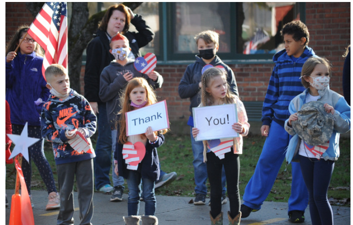
Students and staff members at West Sand Lake Elementary School greet a parade of cars during a Veterans Day vehicle parade.

Veterans Day has long been a staple on the school calendar, being one of the most well-attended events throughout the year. As always, we were excited to show our gratitude, this year in a COVID-friendly way.