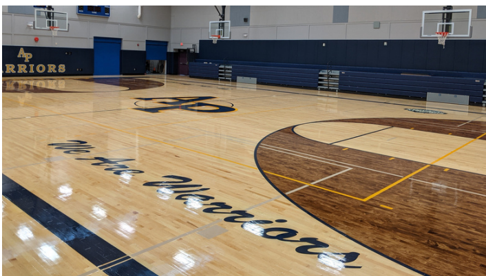
The blue gym at Algonquin Middle School was completely re-done.

With the Reading Apprenticeship Framework, the class works together to create a safe environment where students become aware of who they are as a reader. Key strategies are taught to improve students' literacy skills, as well as be able to transfer the strategies they learned into their other academic classes.