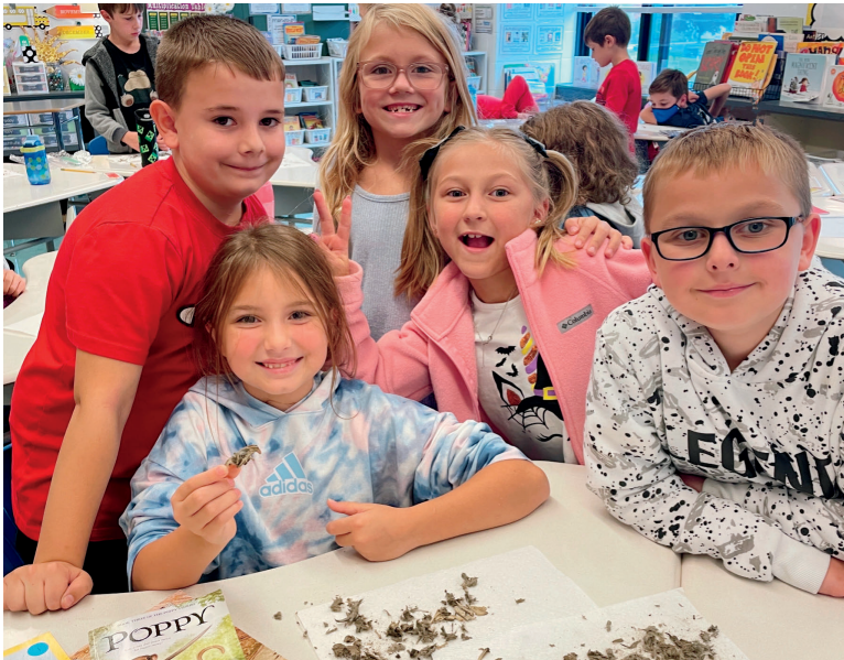
Elementary School students read 'Poppy' in ELA and then did classroom projects related to the book.