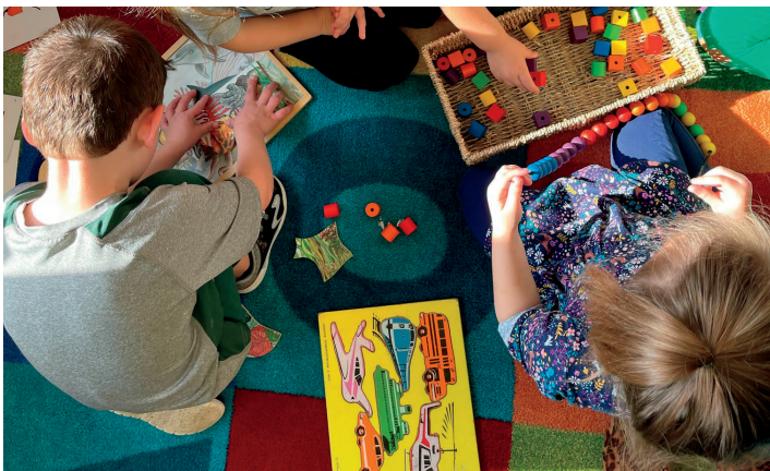
Students work on a centers project at the Universal Pre-K program.

Through Read Side by Side, students experience a dual approach of a teacher-led read aloud that models literacy skill development and book clubs during which groups of students reading the same book apply the skills they have learned through discussion and activities. Teachers and students alike are enjoying the opportunities to read more books, more often.