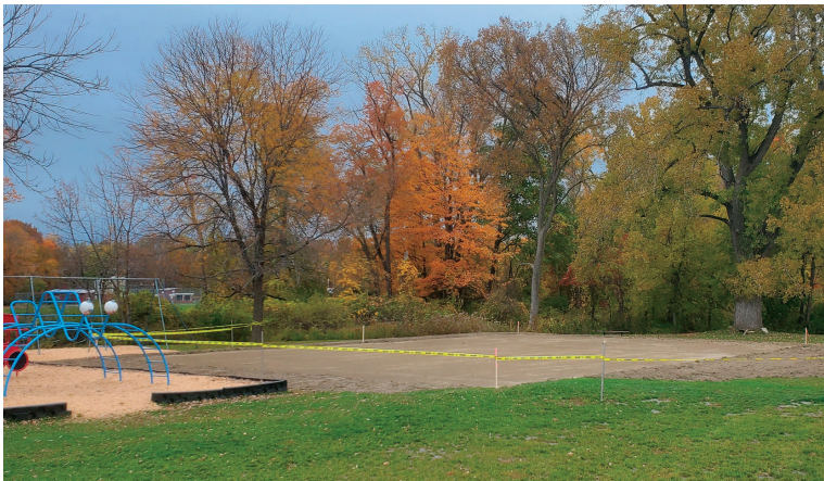
The new basketball court with pickleball lines is being built near the playground at Poestenkill Elementary School.

The Town of Poestenkill has secured donations for materials to create the new basketball court with pickleball lines at Poestenkill Elementary School at zero impact to taxpayers. During the day, students will utilize the new court. When school is not in session, on evenings, and on weekends, the community will be allowed to use the space.