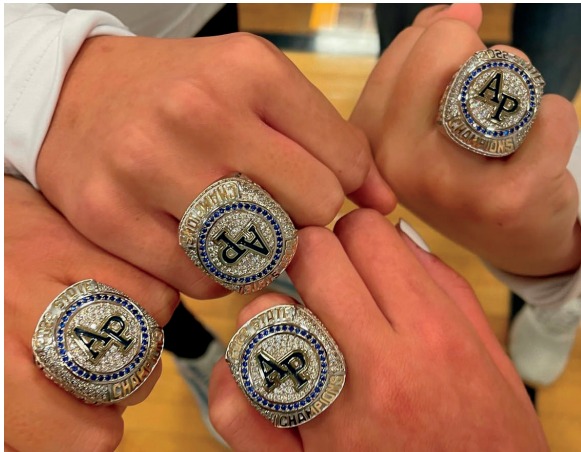
The girls varsity basketball team was presented with state championship rings this fall.

Thank you to our student-athletes and coaches who continue to represent our district extremely well, both on and off the playing field. As a reminder all home contests are free to the community.