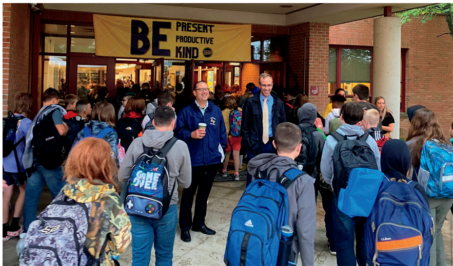
Students rush the doors during the first day of school at Algonquin Middle School.

This year marks the beginning of our first-ever Universal Pre-Kindergarten program. The High School posted a record high graduation rate in 2022. A capital project has begun and a contract that properly recognizes the high