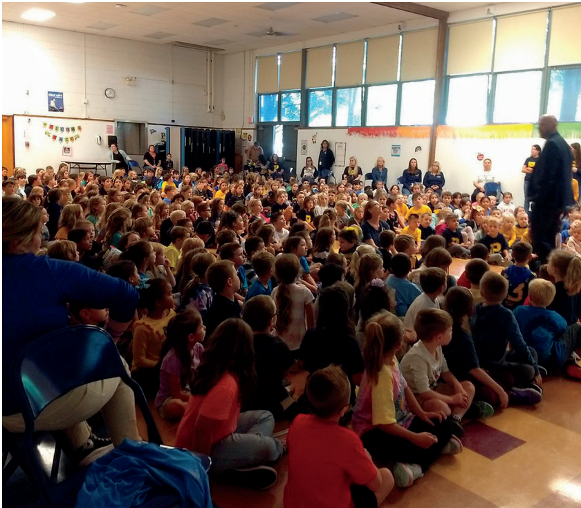
Large scale assemblies have returned, including the PES Pride assembly at Poestenkill Elementary School (shown above).

Schoolwide community-building events link students, parents and teachers together in frequent collaboration and social interaction, helping to foster school traditions and promote inclusiveness.