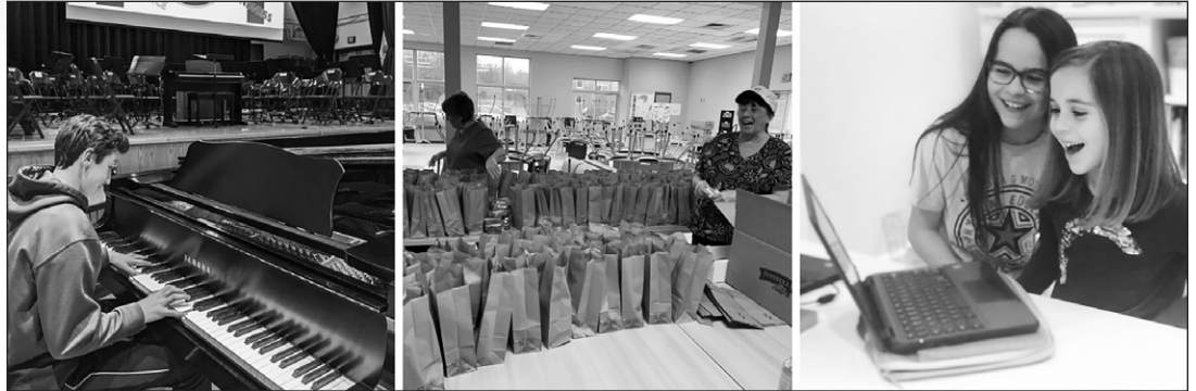
Students and staff went from being in school to remote learning during the 2019-2020 school year.

Voting will take place using absentee ballots only per Governor Andrew M. Cuomo's Executive Order due to the COVID-19 pandemic. Ballots must be received by 5:00 p.m. on June 9.