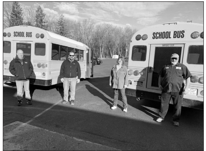
Bus drivers get ready to deliver meals to students during the COVID-19 pandemic.